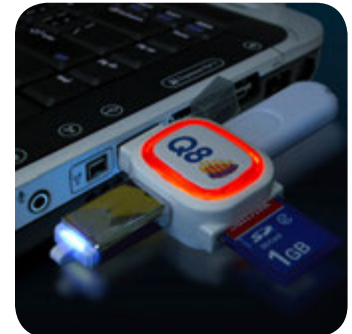
Dual Port USB HUB